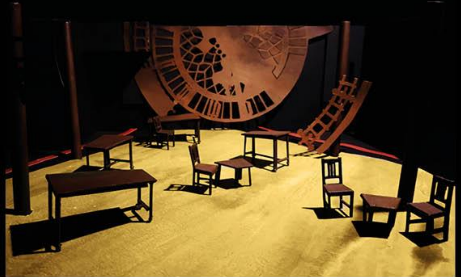
1:25 scale model